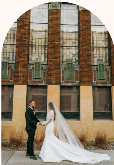
Banquet Hall + Ellerbe Room