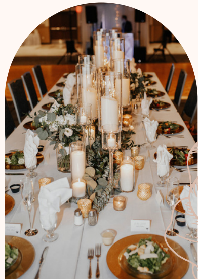
Beverages & Catering

reception • social hour ceremony capacity - up to 500